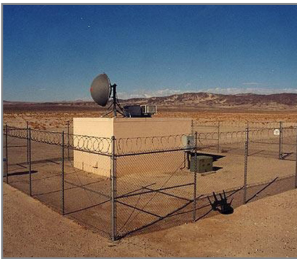
A typical ground electrode control building (About 60 feet by 60 feet fenced area)