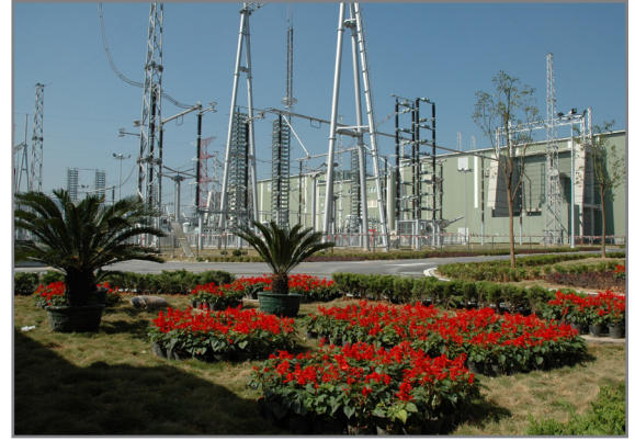
Typical terminal and interconnection facilities