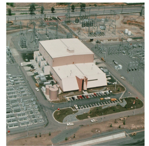
Typical AC/DC Converter Station