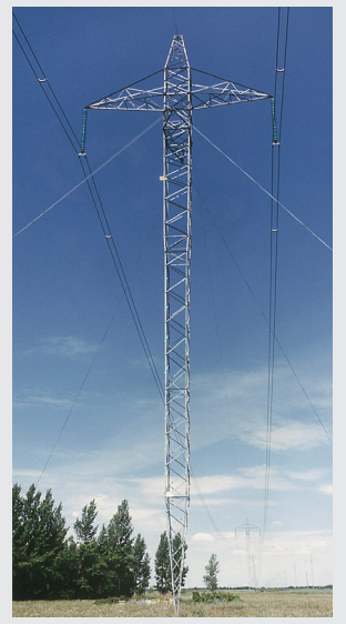
Example structure design under consideration.